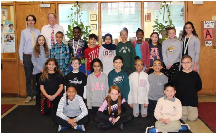
GARRETTFORD GEOGRAPHY BEE PARTICIPANTS